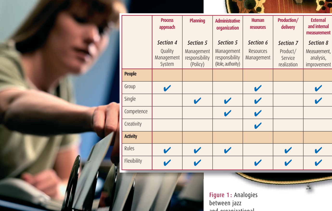
and organizational processes.